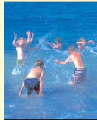
Photo: Gyllyngvase Beach