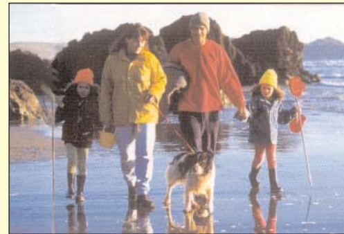
Photo: Whitsand Bay